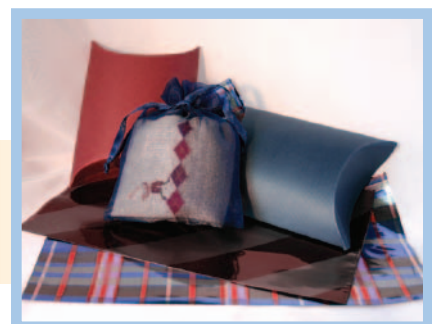
Corporate parties (Christmas, etc.): for your employees