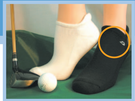
Golf tournaments: for your guests