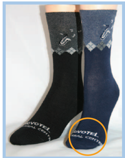
Hotels: for your clients